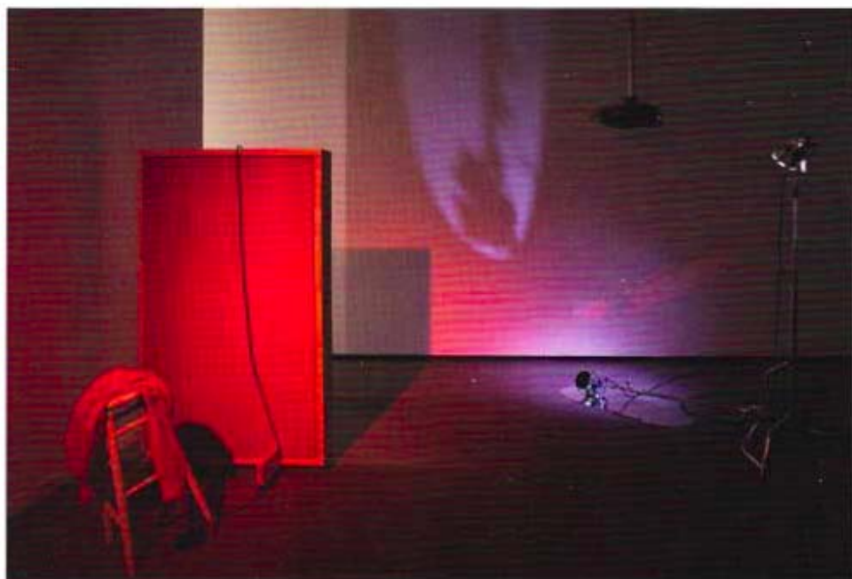
HADLEY•MAXWELL 1+1-1, 2007

to the institutional parameters of exhibiting art, but is a broader response to a dominant cultural and global economy that privileges the singular, the whole, the complete, the product, the frame, etc. as means to contain variation and difference. How Soon Is Now is a collection of spaces, incongruous propositions, competing activities and varied sensory moments juxtaposed in the singular arena of the museum. In this spirit of heterotopia, one can summarize the different modes of viewing that run throughout the exhibition.