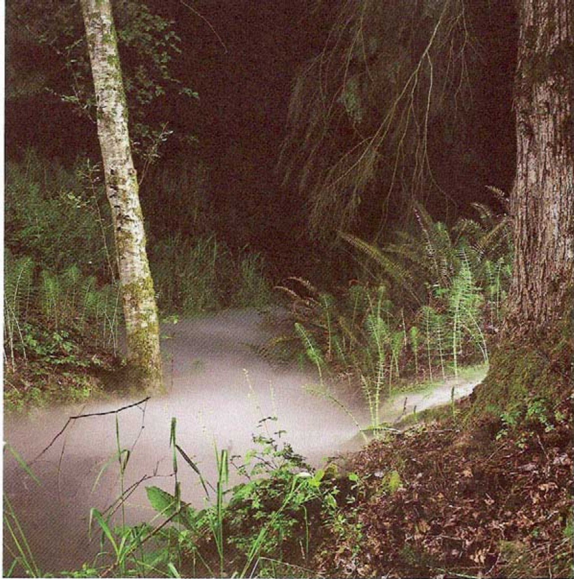
Kevin Schmidt Fog (2004), slide projection, 243.8 x 243.8 cm

KEVIN SCHMIDT also makes absurd, artificial interventions, but in the natural environment. In Fog (2004), for instance, an installation comprising two 8' x 8' slide projections of night shots of the BC forest near Chilliwack, Schmidt enhances the natural landscape with a fog machine. The fog along with the photos' dramatic lighting lends the landscape an artificial and a surreal appearance recalling the dry-ice, stoner spectacle of classic-rock concert culture. The work is a bizarre hybrid of Spinal Tap and Emily Carr. Similarly juxtaposing nature with fakery, Burning Bush (2005) is a five-hour video of a bush in a desert-like landscape near Osoyoos, BC. Appearing to burn, the bush remains miraculously intact because the "flames" are made of silk, lit by orange halogens and blown around by fans. An illusion that has a blatant biblical reference becomes, in an art context, about artistic as well as spiritual artifice.