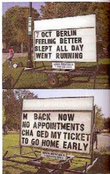
LEFT & ABOVE Germaine Koh, Journal (project ongoing since 1995), journal entries placed in newspaper classified ads and on public billboards, Image Courtesy of the Artist

Koh, however, has managed not only to draw from an array of Conceptualist strategies but also to broaden