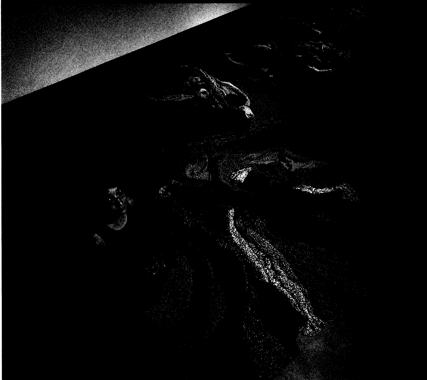
PETER SIBBALD FOR TIME; KINWORK COURTESY ART GALLERY OF ONTARIO/MCMASTER MUSEUM OF ART